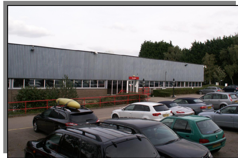
Extensive Car Parking

The floor and site areas are approximate.